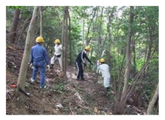
Forest conservation activities

•SEGES (Social and Environmental Green Evaluation System)