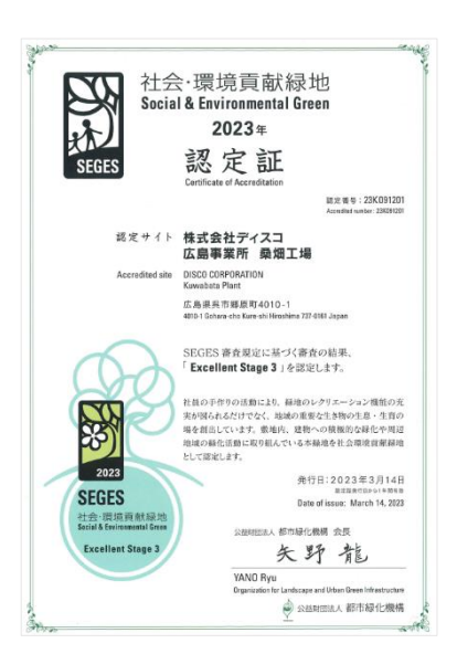
Excellent Stage 3 Certification (Kuwabata Plant)