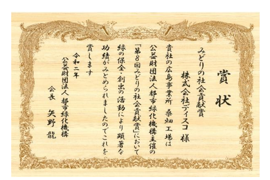
The Green Social Contribution Award